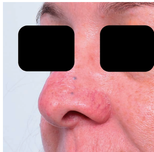
Figure 1: Three bluish papules can be seen on the nasal dorsum following Er:YAG laser treatment

She has a past history of two basal cell carcinomas and one squamous cell carcinoma in-situ on the nose. These had been successfully treated with surgical exci-