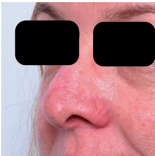
Figure 2: Three very small papules can be seen on the nasal dorsum prior to laser treatment

The aetiology and pathogenesis of apocrine hidrocystoma is unknown. It has been proposed that trauma