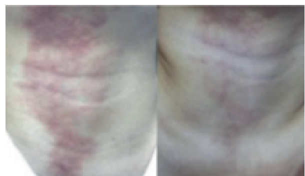
Figure 4. A sixteen-year-old girl with a PWS on her neck: prior to laser therapy (left side); and three months after treatment with nanosecond laser (595 nm) using a spot size of 5 mm with an energy density of 0.3 J/cm 2 , 5Hz, and three passes (right side).